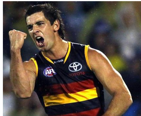
Adelaide Crows Captain, Broken Hill's Taylor Walker

Far West NSW has nurtured the rise of numerous individuals to an elite level in their chosen sport.